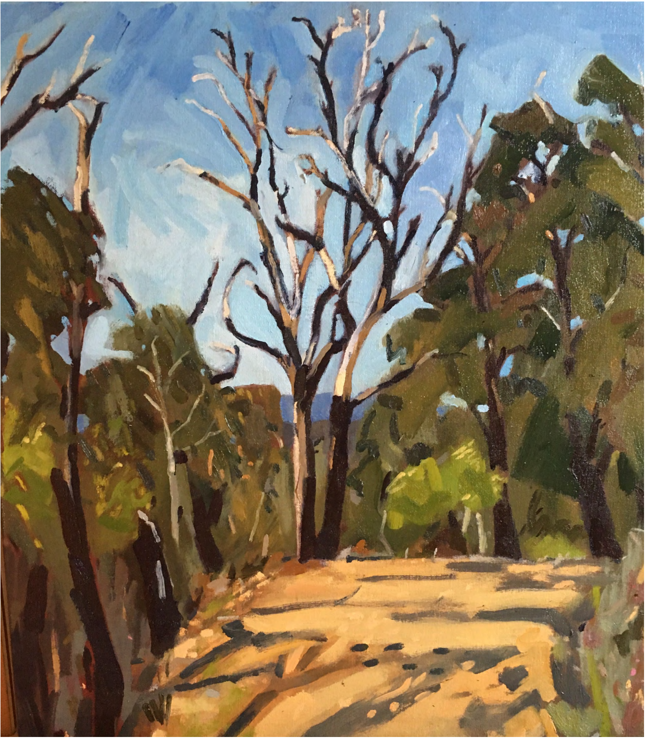
7. Top of Old Kinglake Road, Kinglake