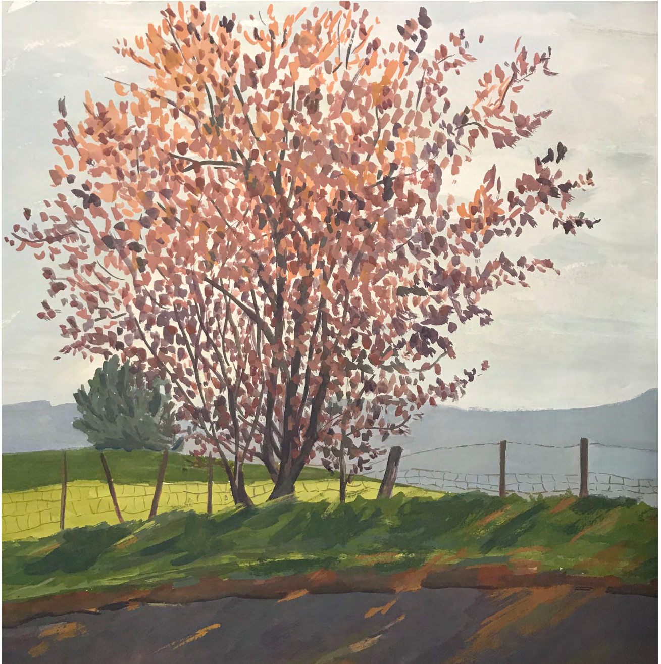
1. Just Like Spring Rain, Christmas Hills